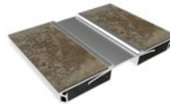
Expansion Joint Systems