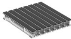
Entrance Mats + Grilles