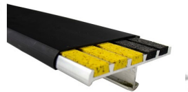
Stair Treads + Nosings